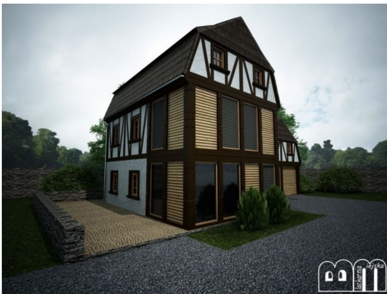
Nowoczesna forma domu przysługowego wg bM.

bM poszło trochę innym torem, nie skupiając się konkretnie nad samym układem funkcjonalnym pojedynczego domu, a bardziej nad stworzeniem domu wariantowego, którego forma, pojemność czy choćby sam wygląd i lokalizacja mogłyby być formą zmienną, zależną od danej sytuacji finansowej i demograficznej rodziny oraz własnych, określonych potrzeb jednostki. Upraszczając - założeniem było stworzyć taki dom, który w każdej chwili można rozbudować, zmodernizować, zmniejszyć czy choćby spakować w przysłowiowe paczki i przenieść w inną lokalizację, gdy życie nas zmusi do nieoczekiwanej przeprowadzki czy pogoni za pracą. Oczywiście skąd taki pomysł na mobilny dom - to sytuacja trudna do wyjaśnienia w kilku zdaniach. Trzeba by najpierw dokładnie zapoznać się z genezą domów przysługowych i ich dzisiejszą problematyką, a dopiero później próbować dyskutować czy taki pomysł ma szansę zaistnienia. Tak czy siak pomysł nie przypadł do gustu jury więc chyba nie ma o czym dyskutować. Poniżej nasza praca.