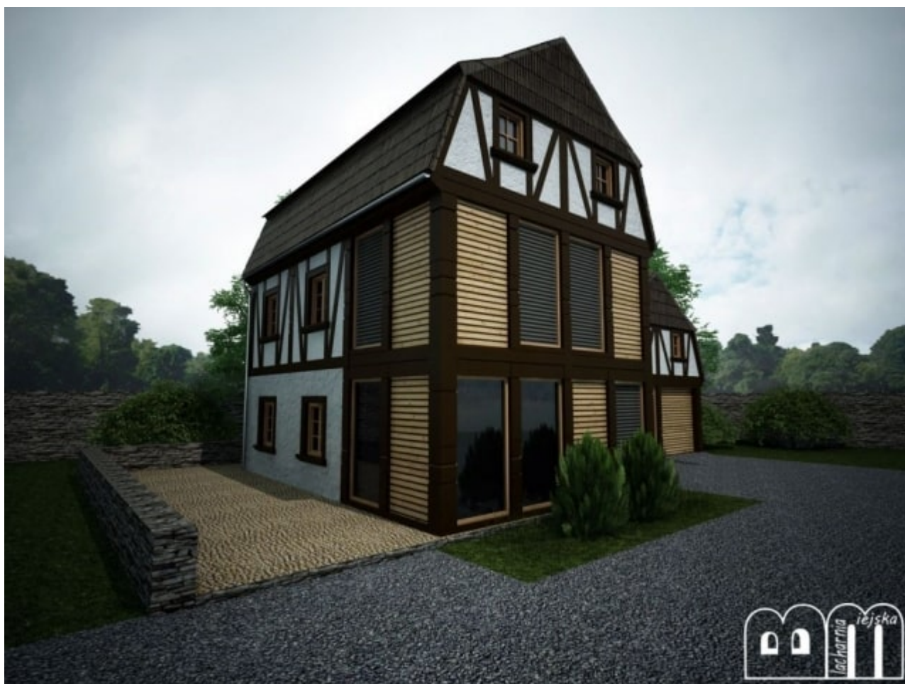
Nowoczesna forma domu przysługowego wg bM.

bM poszło trochę innym torem, nie skupiając się konkretnie nad samym układem funkcjonalnym pojedynczego domu, a bardziej nad stworzeniem domu wariantowego, którego forma, pojemność czy choćby sam wygląd i lokalizacja mogłyby być formą zmienną, zależną od danej sytuacji finansowej i demograficznej rodziny oraz własnych, określonych potrzeb jednostki. Upraszczając – założeniem było stworzyć taki dom, który w każdej chwili można rozbudować, zmodernizować, zmniejszyć czy choćby spakować w przysługowe paczki i przenieść w inną lokalizację, gdy życie nas zmusi do nieoczekiwanej przeprowadzki czy pogoni za pracą. Oczywiście skąd taki pomysł na mobilny dom – to sytuacja trudna do wyjaśnienia w kilku zdaniach. Trzeba by najpierw dokładnie zapoznać się z genezą domów przysługowych i ich dzisiejszą problematyką, a dopiero później próbować dyskutować czy taki pomysł ma szansę zaistnienia. Tak czy siak pomysł nie przypadł do gustu jury więc chyba nie ma o czym dyskutować. Poniżej nasza praca.